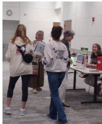
City of Wellness 2023