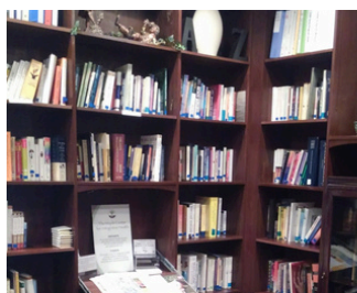
DR. JOHN BLACK MEMORIAL LIBRARY ONLINE