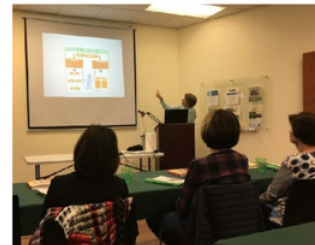
LEAF- Turning Over a New LEAF